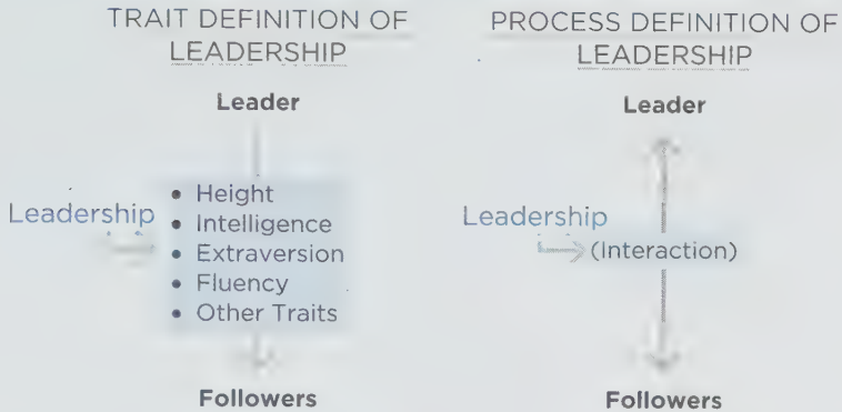
FIGURE 1.1 The Different Views of Leadership